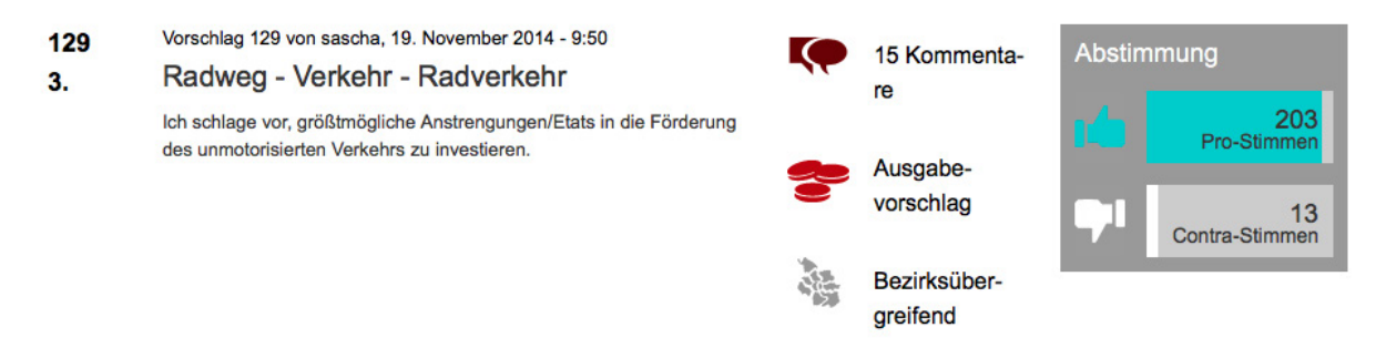
Figure 4: Transparency in Cologne's participatory budgeting portal<sup>43</sup>

The platform of the city of Cologne<sup>42</sup> is innovative in terms of transparency. Not only can citizens pitch their own ideas, they can also directly see how many votes in favor and against an idea were received. In addition, they are allowed to comment and review comments made.