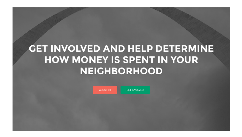
Figure 3: Encouraging design on the St. Louis participatory budgeting website<sup>41</sup>

The website by St. Louis participatory budgeting gives a very simple introduction asking to "GET INVOLVED AND HELP DETERMINE HOW MONEY IS SPENT IN YOUR NEIGHBORHOOD" and offer the choice between learning more and directly getting involved. This distinguishes those who directly want to get involved from those who want to know more. However only little information follows when clicking the buttons. Most information is on the bottom of the landing page which is not indicated clearly. The choice of the buttons with colors red and green can be optimized as well to help citizens with the not uncommon inability to distinguish red and green. The same website shows the view from underneath one of the cities most famous landmarks which offers a way for the citizens to identify with the city's cause.