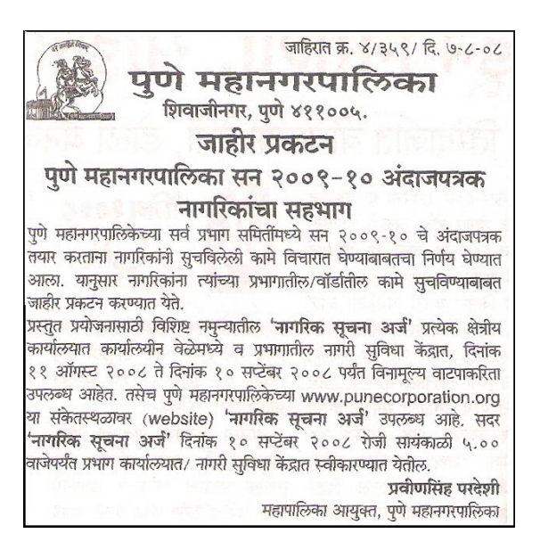
Figure 7: Newspaper announcement in Pune<sup>64</sup>

Finally, spread the information about the participatory budgeting process in those places where the current contested themes in politics are already discussed. This can be community centres, youth clubs etc. but also the local playground especially if that is on the agenda. To amplify the impact of the outreach it makes sense to announce the participatory budgeting process in the traditional media. Pune for example announced that it is calling for project idea submissions in the leading newspaper Marathi daily.